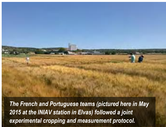
The French and Portuguese teams (pictured here in May 2015 at the INIAV station in Elvas) followed a joint experimental cropping and measurement protocol.

This senescence inflexion date is therefore a reliable wheat performance indicator in conditions giving rise to significant water stress, and can be used by plant breeders and agronomists. The only constraint is the frequent measurement of the NDVI index.